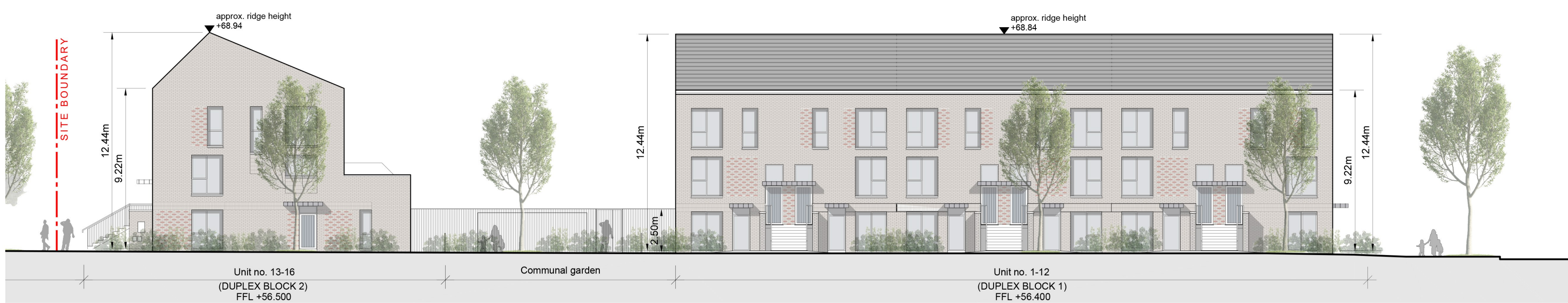
SECTION L-L CONTINUED